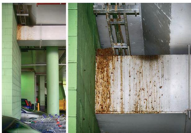
Figure 7. Feral pigeons nesting in the carpark and associated soiling nesting and roosting (Westfield Shopping Centre, Parramatta, NSW) (Photo Dirk HR Spennemann July 2015)