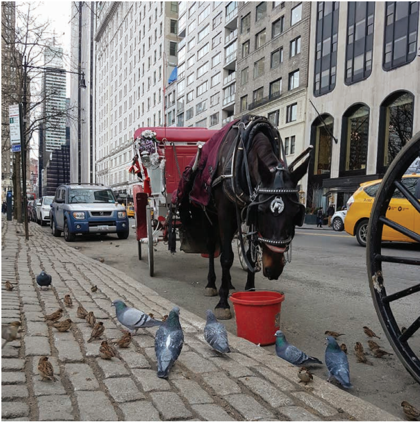
Figure 3. Feral pigeons and domestic sparrows feeding on animal food spillage (Central Park, New York)