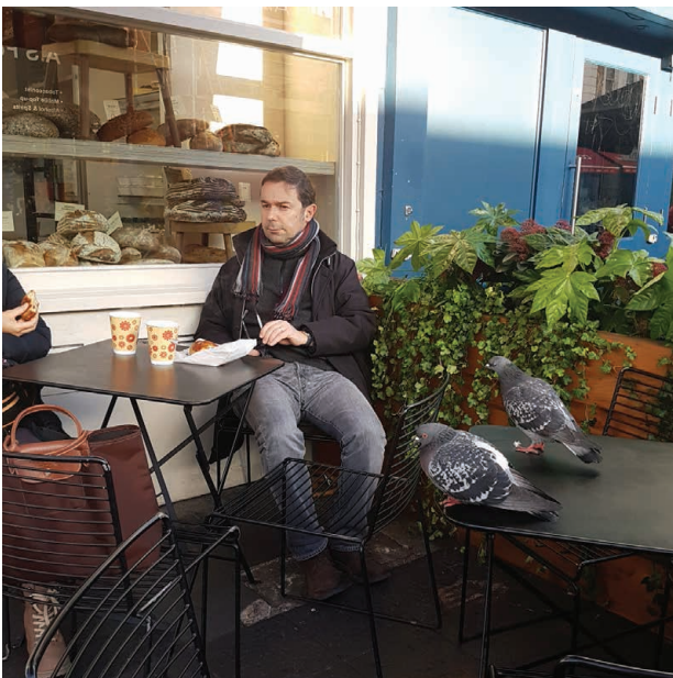
Figure 5. Feral pigeons feeding waiting for spillage of human food (South Kensington, London)