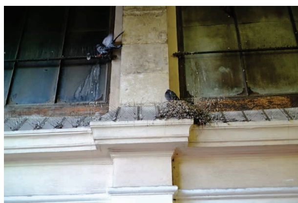
Figure 8. Feral pigeons nesting despite pigeon spikes (Passage Vendôme, 3ème arrondissement, Paris)