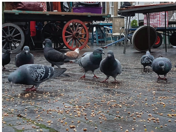
Figure 6. Feral pigeons feeding on volunteer food (Bermondsey Markets, London) (Photo Dirk HR Spennemann January 2017)

ments) than human, processed foods. The documented high individuality of the birds, their food preferences, as well as the variable nature of accessible food sources results in a high variability of the faecal pH. Once voided, the external factors, such as leaching by rainwater as well as colonisation by bacteria and fungi, change the acidity levels. This too is not uniform but dependent on relative humidity, temperature and available sources of fungal spores.