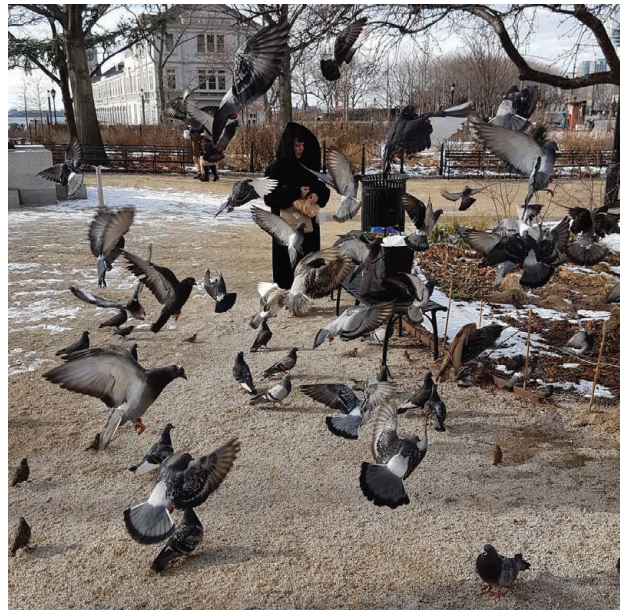
Figure 4. Volunteer food (bread) offered to feral pigeons by a member of the public (Battery Point, New York) (Photo Dirk HR Spennemann January 2017)